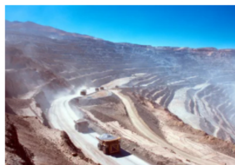
Now is a Great Time to Invest in Latin American Mining