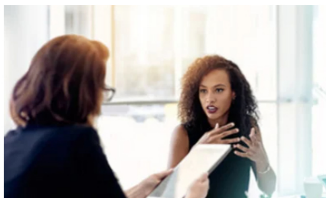
Do you have the skills it takes to succeed in new roles? HBS Executive Education