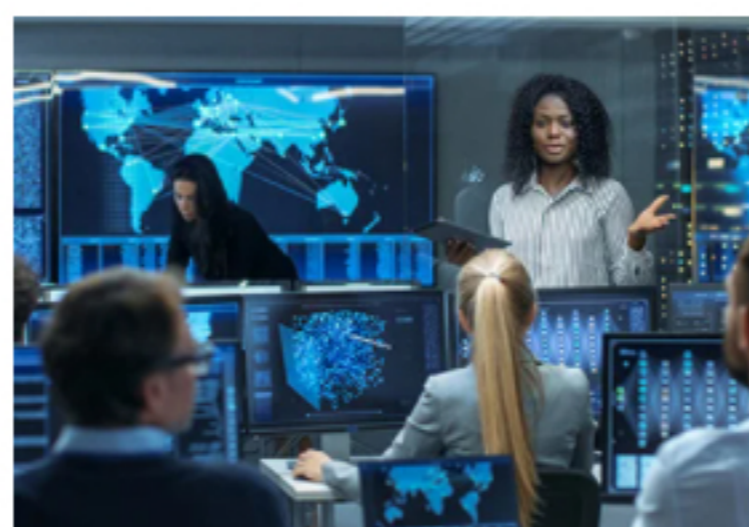
Transform your company into an AI-first leader with this new program.