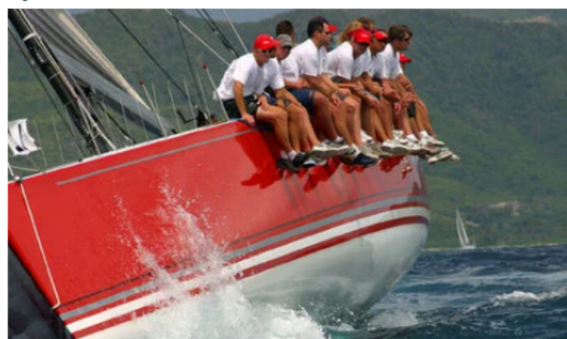
#1 Rated ETFs – ETFG Weekly Select List – 3/30/21 ETF Global