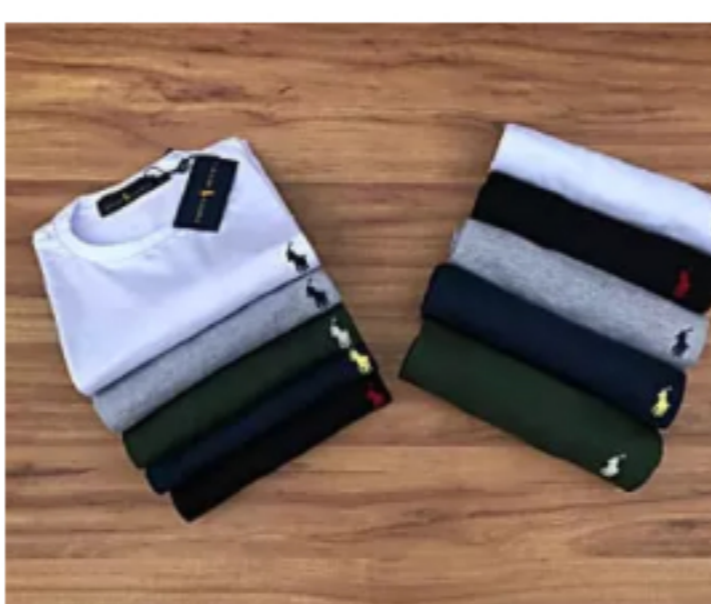
O kit mais esperado está de volta! 5 Ralph Lauren por R$299 em 3x sem juros e frete grátis, aproveite