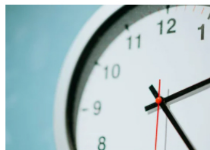
A perfect pension? The AIC