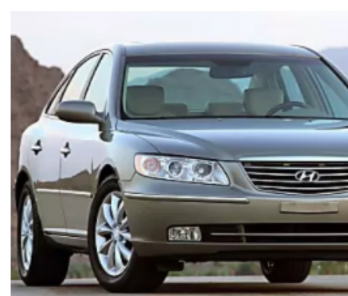
Veja agora! 20 Carros para parecer rico gastando pouco